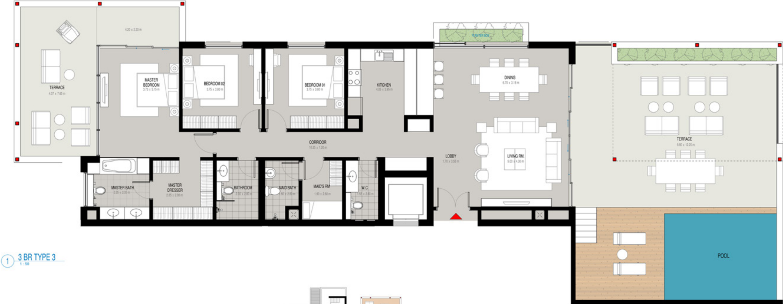
1 3 BR TYPE 3 1 : 50