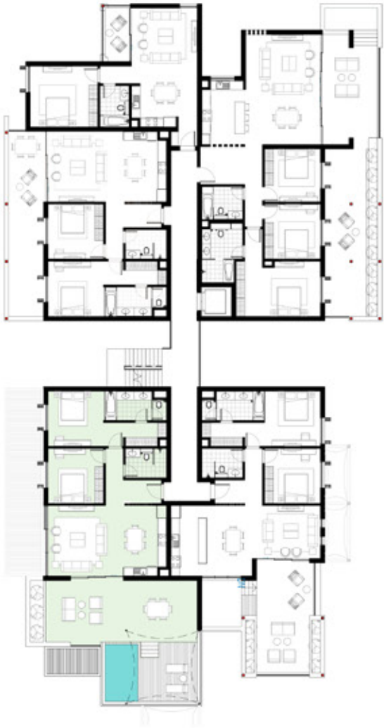
4 KEY PLAN-2BR TYPE 1 - M&4 - LEVEL 01 1 : 200