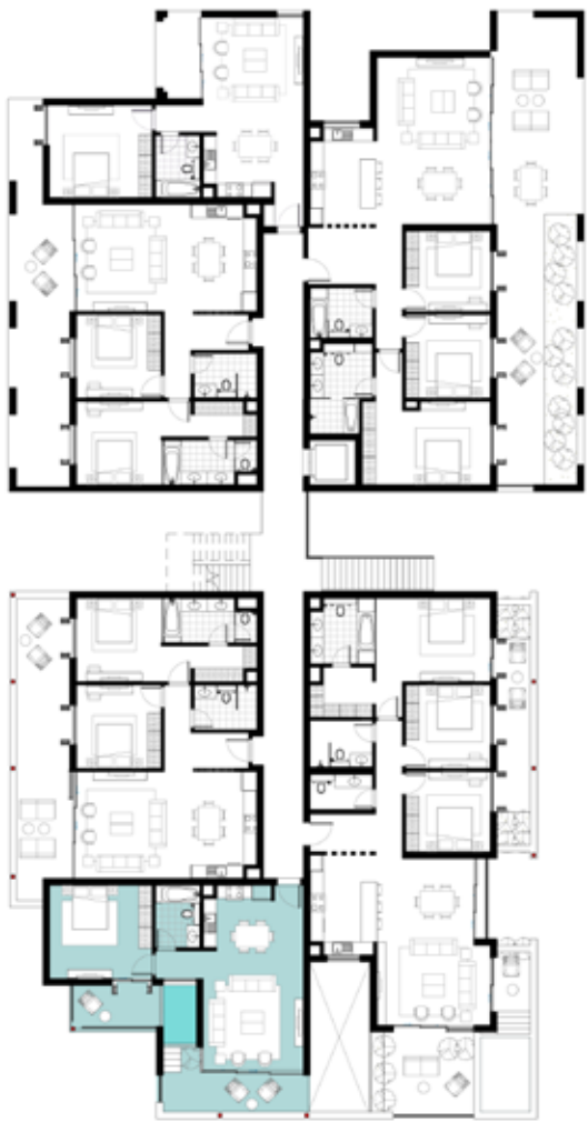
4 KEY PLAN-1BR TYPE 1- GROUND FLOOR 1 : 200