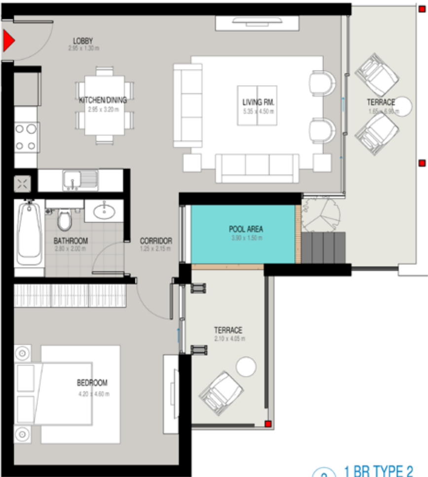
2 1 BR TYPE 2 1 : 50