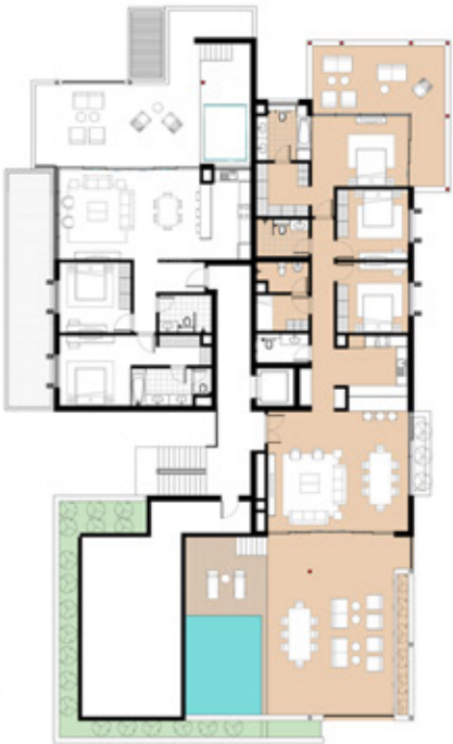
2 KEY PLAN-3BR TYPE 3 - LEVEL 02 1 : 200