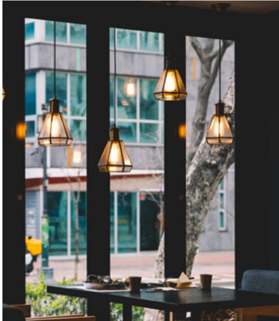
RESTAURANTS & CAFES