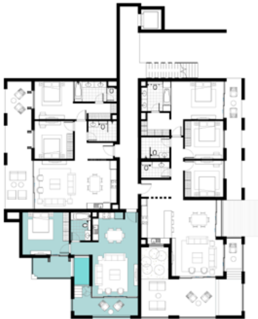
5 KEY PLAN-1BR TYPE 2- LOWER GROUND LEVEL 01 1 : 200